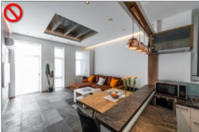
□ □ □ □ □ shutterstock_439286914.jpg 1/19/2020 12:00:00 AM Kitchen, Living room Natural Stone