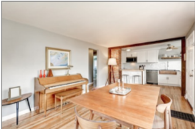
□ □ □ □ □ shutterstock_503917483.jpg 1/1/2025 12:00:00 AM Kitchen Vinyl