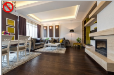
□ □ □ □ □ shutterstock_363430451.jpg 2/3/2023 12:00:00 AM Living room Vinyl